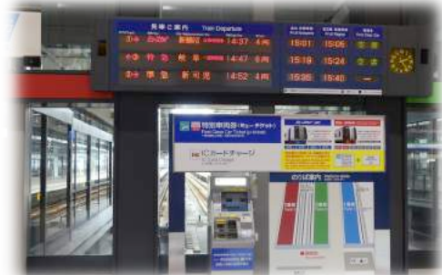
↑ Platform entrance at the airport station